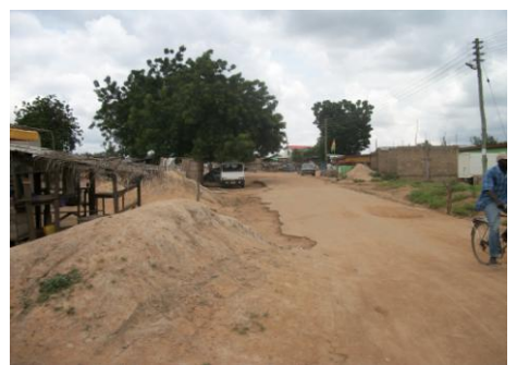
Some selected pictures of Ashaladja Community